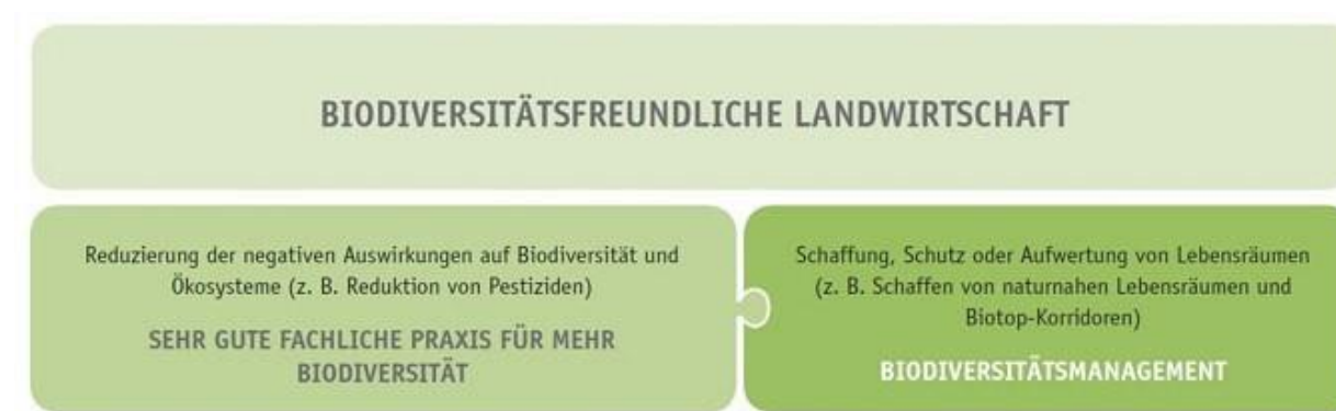
Figure 1 Fields of action of the BAP

A Biodiversity Action Plan should focus on the two main areas of biodiversity conservation, biodiversity management (Chapter A) and VERY good practice (Chapter C) (Figure 1).